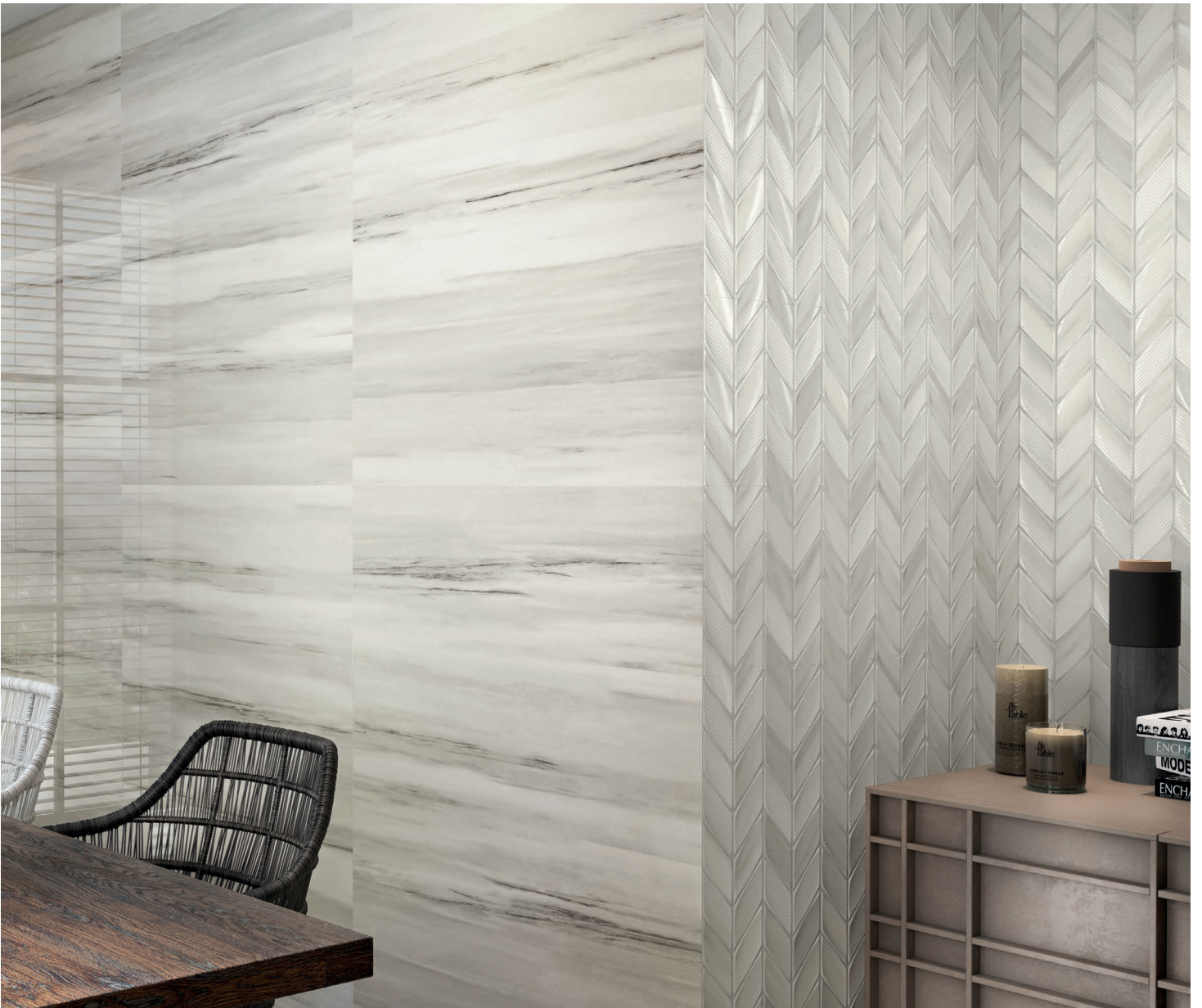
ASH Aden Deco Bright (Decorative wall on the right)