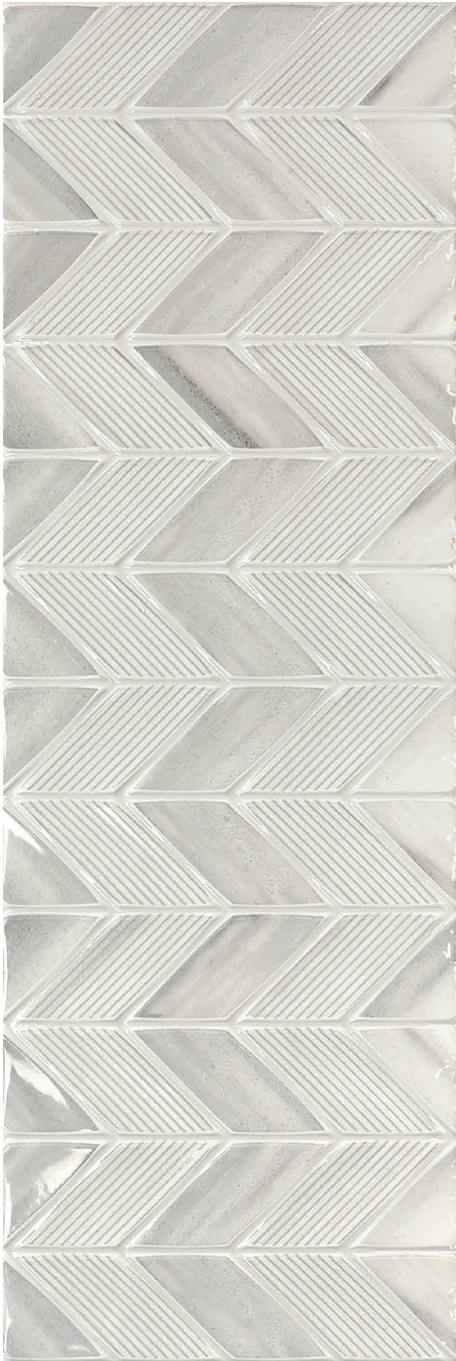
ASH Aden Deco Bright 30 x 90 cm (11.811" x 35.433") DN.RV.ASH.1236.AD.BR

All items shown in this document are part of Olympia's stocking program. For special orders, please contact your Olympia Tile Sales Representative.