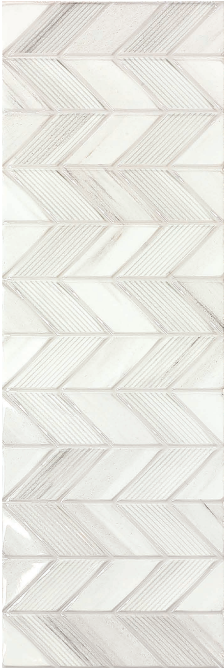
WHITE Aden Deco Bright 30 x 90 cm (11.811" x 35.433") DN.RV.WHT.1236.AD.BR